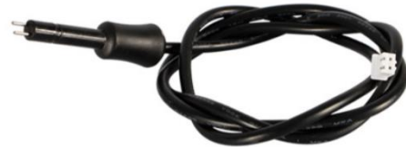
Figure 1: TDS sensor

The unit of measurement for TDS is mg/L, which indicates how many mg of dissolved solids are dissolved in 1L of water. The higher the TDS value, the more dissolved solids the water contains.