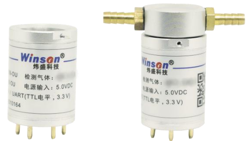
Natural diffusion type

The module is equipped with sensors with good linearity, high precision, high sensitivity, strong anti-interference ability, excellent repeatability and stability, and combined with temperature and humidity compensation algorithms, greatly improving the reliability of the module.