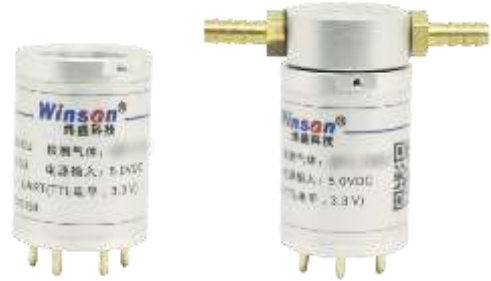
Natural diffusion type

The module is equipped with sensors with good linearity, high precision, high sensitivity, strong anti-interference ability, excellent repeatability and stability, and combined with temperature and humidity compensation algorithms, greatly improving the reliability of the module.