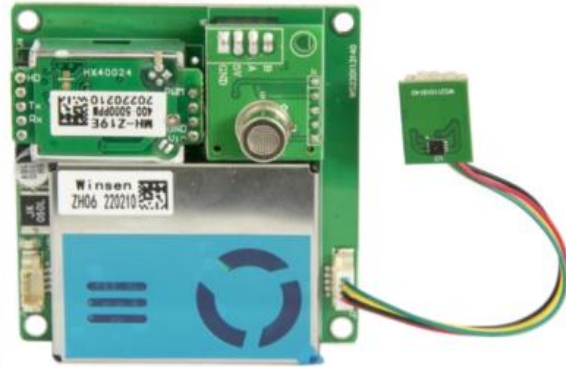
Fig2 : VOC version